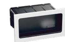
UEBF* BORA 3box wall sleeve