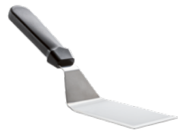
PTTS1 BORA tepan scraper