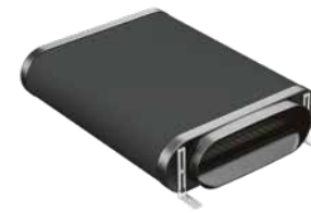
ULB1 BORA air purification box

Powerful filters for your recirculation system