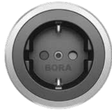
USTF BORA socket (type F) Countries: DE/AT/NL/ ES/IT/LU/PT/RU/BR/SE

Available in 5 country-specific variants