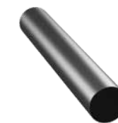
ER1000 Round duct 1000 mm