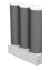
ULB3 BORA air purification box with 3 activated charcoal filters

Further information on BORA products can be found in the BORA ventilation handbook and at www.bora.com in the PartnerNet.