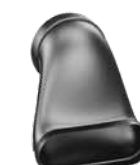
EFRV* Transition shallow round offset