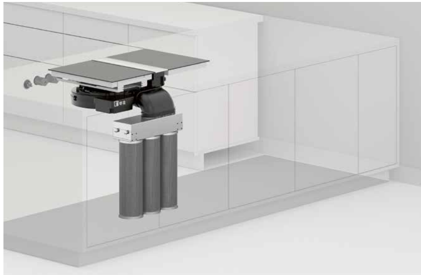
Installation example with recirculation