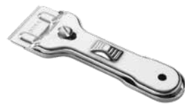
UGS BORA glass ceramic scraper