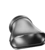
EFRG* Transition shallow round straight