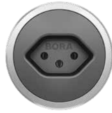
USTJ BORA socket (type J) Countries: CH/LI