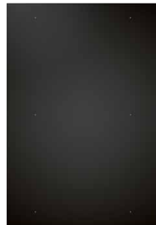
BORA Professional 2.0 Cooktop 2