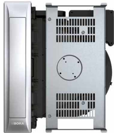
BORA Professional 2.0 (PKAS) Cooktop extractor system