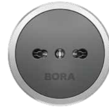
USTL BORA socket (type L) Countries: IT/SL