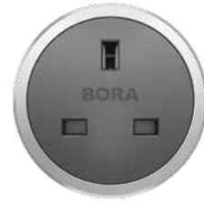
USTG BORA socket (type G) Countries: UK/AE/SG