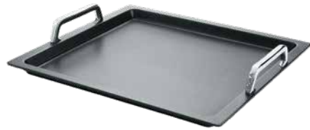
UGPC1 BORA grill pan, Ceran