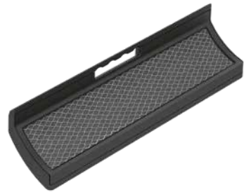
PKA1FF BORA Professional 2.0 stainless steel grease filter