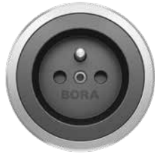
USTE BORA socket (type E) Countries: FR/PL/DK/ BE/CZ/SK