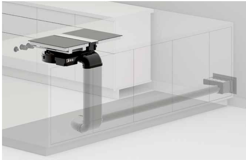
Installation example with exhaust air