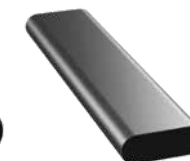
EF1000 Shallow duct 1000 mm